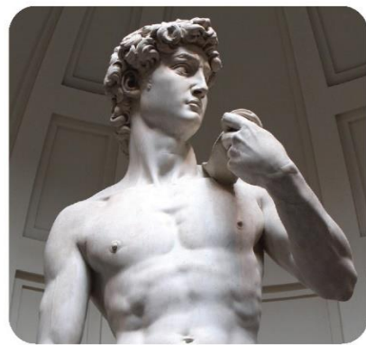
MICHELANGELO'S DAVID

From this document: “Using and/or producing pornography is a sin against chastity and against human dignity.... The sin of pornography needs the Lord’s forgiveness and should be confessed in the sacrament of penance. Pornography objectifies people and brings hurt and pain. It is an illusory substitute for real relationships and intimacy, which in the end bring true joy. Many good people struggle with the sin of pornography and [strive] to cultivate chastity. You are not alone. Jesus is with you, the Church offers you love and support. Trust in the Lord’s mercy and his power to free and heal you.” ●