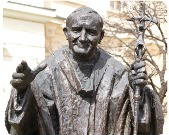
Sculpture of a smiling Pope St. John Paul II outside the Saint John the Baptist Cathedral in Trnava, Slovakia.

Saint Irenaeus (125–202) said that the glory of God is the human fully alive which reflects Jesus' own words, "I came so that they may have life; and have it more abundantly" (John 10:10). Saints enjoy life! The nearsighted St. Alphonsus Liguori (1696–1787), founder of the Redemptorists, sat in the back row of the Naples theater with his glasses off so he could enjoy the music he loved without the distraction of the half-naked chorus line. Saint Teresa of Ávila (1515–1582), caught devouring partridge in the convent kitchen, said, "When I pray, I pray; when I eat partridge, I eat partridge!" Saint Joan of Arc (1412–1431) loved horses, and St. Charles Borromeo (1538–1584) loved chess. Indeed, saints do smile. They even laugh. ●