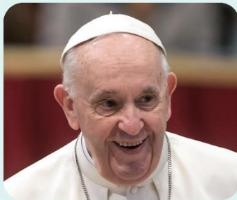
STEFANO DAL POLOZZO / CNS