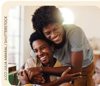
JILCO JULIA AMARAL / SHUTTERSTOCK