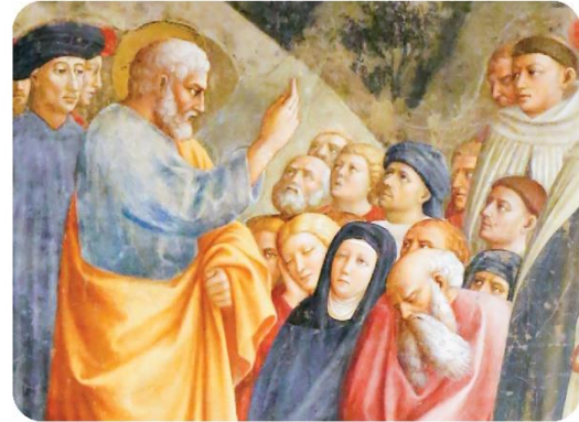
ST. PETER PREACHING, BY MASOLINO

Jesus was a first-century Jew, as were his first disciples. They continued their Jewish practices after Jesus' resurrection, but they believed and proclaimed that Jesus was the long-awaited Messiah, the fulfillment of Judaism. Such claims inevitably led to clashes with Jewish authorities, as when St. Stephen, the first martyr, was charged with blasphemy and stoned to death in Jerusalem in the year 36 (Acts 6–7).