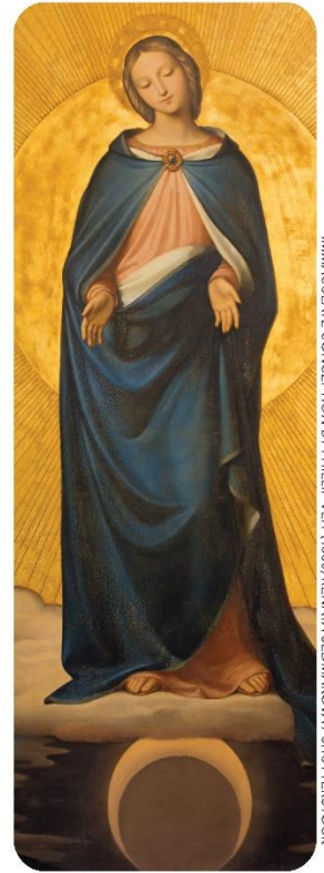
IMMACULATE CONCEPTION BY PHILIP VEIT (1830)

Mary's Immaculate Conception was celebrated many centuries before Pope Pius IX defined it as dogma on December 8, 1854: "The doctrine that maintains that the Blessed Virgin Mary in the first instant of her conception, by a unique grace and privilege granted to her by Almighty God, in consideration of the merits of Jesus Christ the Savior of mankind, was preserved free from all stain of original sin, is a doctrine revealed by God and therefore must be firmly and constantly believed by all the faithful" ( Ineffabilis Deus ). In fact, eight years before, in 1846, the bishops of the United States had already adopted the Immaculate Conception as the patronal feast for Catholics in this country.