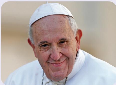
YARA NARDI / CNS