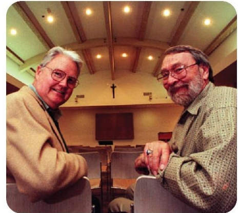
A candidate and his sponsor sit for a photo after an Order of Christian Initiation for Adults (OCIA) class.

I am happy you have responded to the stirrings of the Holy Spirit within you and answered the call to deepen your spiritual practice and journey. The Church needs you. The people of God welcome you. You are beloved among us, and your response in faith is a powerful witness, a reminder to those who may be tempted to take for granted the gift of faith. Thank you. ●